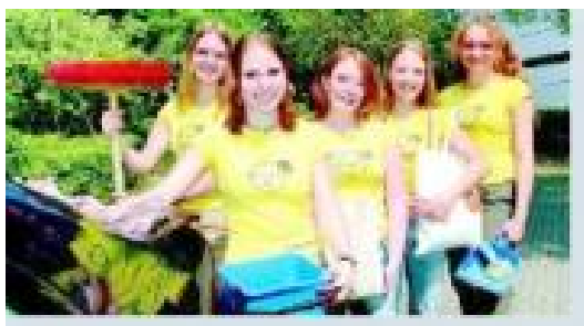
The five ladies of PIA - 'Produkte im Alltag' (Solutions in Daily Life)

ness management – and all this while continuing their education.